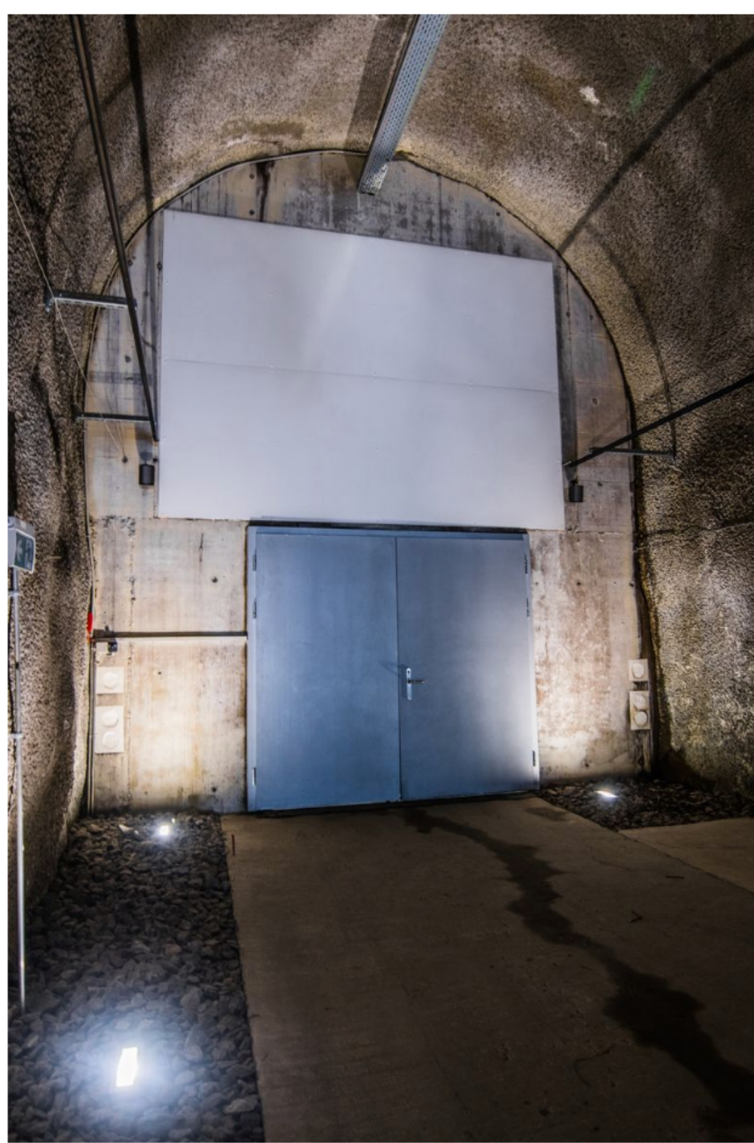
Entrance into the mountain Bruenig Mega Safe AG

The Swiss vaults will range from 100 cubic meters (3,531 cubic feet) to 1,000 times that large with heights of up to 90 meters, according to the website. The rock walls ensure a constant relative humidity of 40% and temperature of 12 degrees Celsius (53.6 degrees Fahrenheit). Prices start at $500,000 and go up from there.