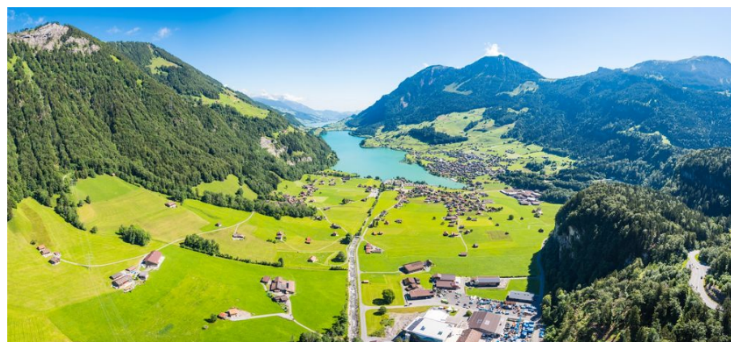
View of Lake Lungern from the Bruenig massif Bruenig Mega Safe AG

By Leonard Kehnscherper 10. Juli 2020, 09:00 MESZ